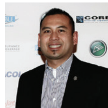
2021 IEC NATIONAL MEMBER OF THE YEAR AWARD WINNER