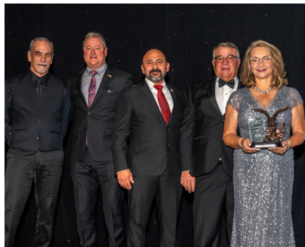
2021 IEC LEGISLATIVE CHAPTER OF THE YEAR AWARD WINNER IEC ROCKY MOUNTAIN

All featured photos including the cover are of 2021 IEC National Award Winners.