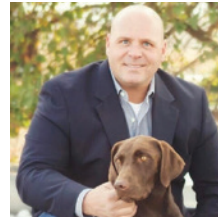
2021 IEC APPRENTICESHIP ALUMNI AWARD WINNER